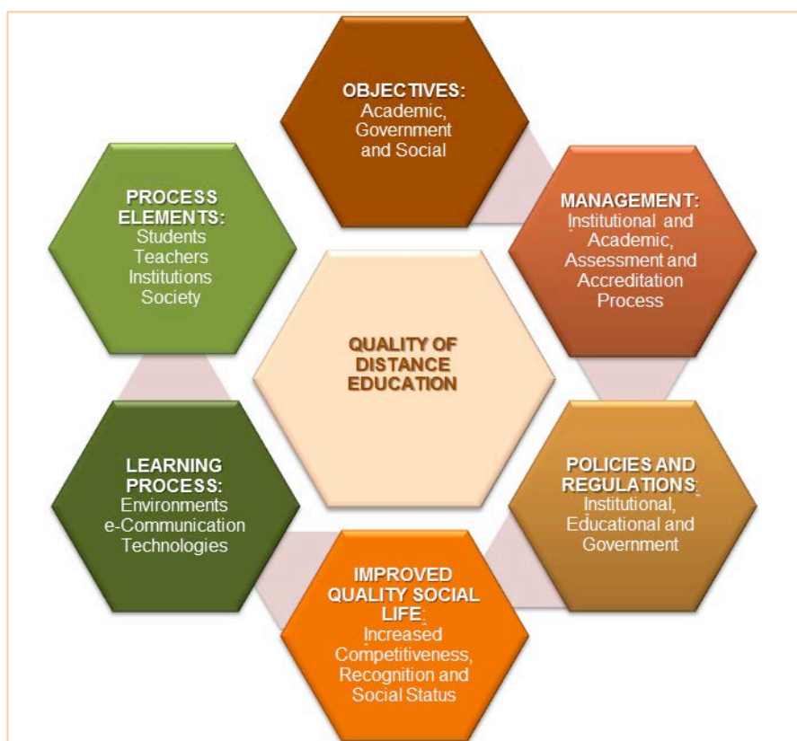
Figure 1. General Elements associated with the Quality of Distance Education.

The quality of the teaching-learning process in distance education is defined by the ability to set the appropriate media conditions that allow the development of new paradigms for teaching, learning and communicating through which meaningful learning is achieved. In this sense, the incorporation of information technology, communication and collaboration (TICC's) should make it possible to effectively link teachers and students with the teaching-learning process, thus preparing new generations with a perspective oriented reflection, self-training and appropriation of technologies that facilitate the achievement of learning dynamic and versatile.